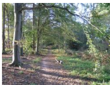
Through the wood