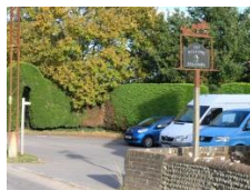
A The Welcome Stranger