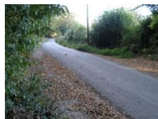
Road to All Saints

Walk along the steep sided path, passing the badgers' den on the left. The path opens to an oak wood on your left and views of Herstmonceux Place on your right.